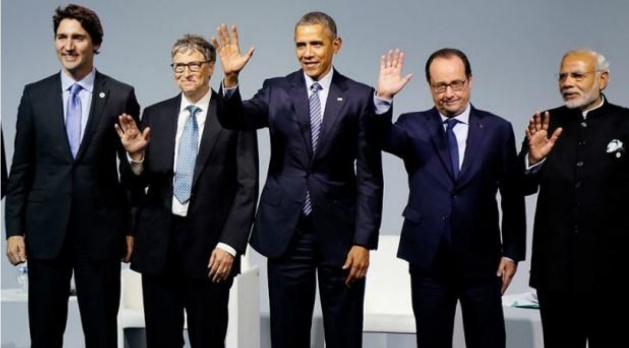
Canadian Prime Minister Justin Trudeau, Microsoft co-founder Bill Gates, Former US President Barack Obama, French President Francois Hollande and Indian Prime Minister Narendra Modi at the Paris Climate Conference in 2015.

After rising by 0.113C per decade between 1950 and 1999, temperatures appeared to have stabilized between 2000 and 2014, despite rising levels of CO 2 emissions, which climate change scientists said were responsible for the earlier warming.